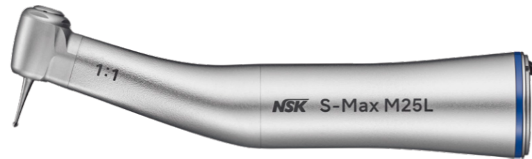
1:1 Direct Drive

OPTIC MODEL: M25L ORDER CODE: C1024 NON-OPTIC MODEL: M25 ORDER CODE: C1027